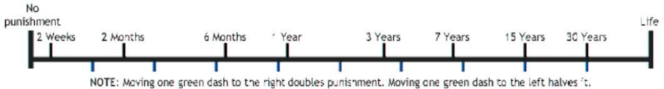
Figure 2. Scale Used by Subjects to Assign Punishment to Hypothetical Offenders

After marking their judgments on this scale, subjects were given additional facts and asked whether those facts should have any effect on the amount punishment imposed. Subjects were shown one fact at a time, each fact corresponding to an extralegal punishment factor. When subjects answered “yes,” they accessed the scale in Figure 2 and were instructed to indicate new punishment assignments. Baseline assignments were marked for reference.